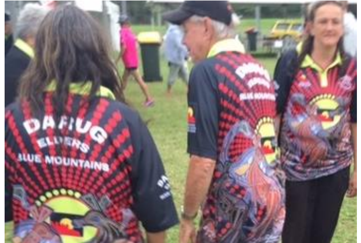
Photo from last year's Olympics

Our Elders are about to head off to Lake Macquarie for the Elders Olympics at Spear Point Complex on Bahtabah & Biraban Local Aboriginal Land Councils. We are hoping for good weather to support our teams playing footy in the hole, quoits, relay races, egg and spoon races, plus much more. They travel out on the 18 th of April and return on the 21 st of April. Let's wish them all the best as they go out there to give it their best.